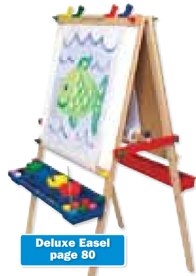
Deluxe Easel page 80