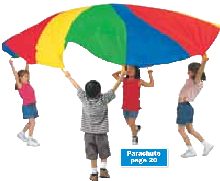
Parachute page 20