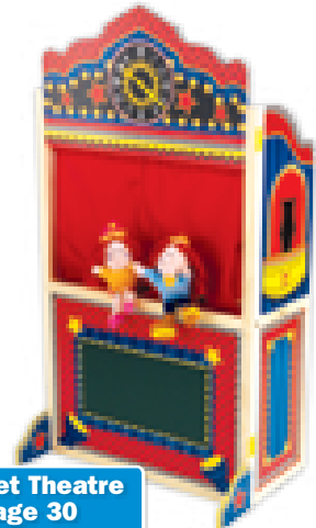
Puppet Theatre page 30