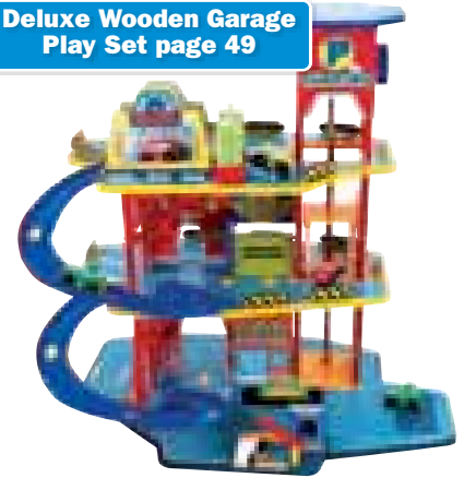
Deluxe Wooden Garage Play Set page 49