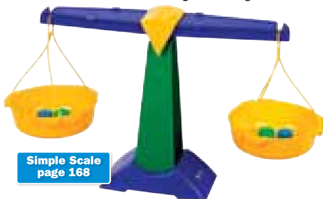
Simple Scale page 168